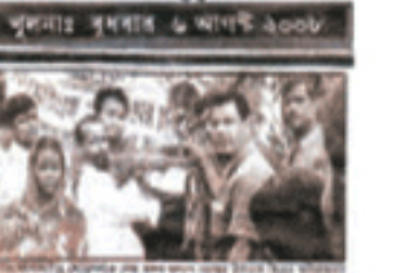
১৯শে জানুয়ারি ২০০৮