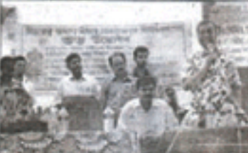
বাংলাদেশের সড়ক দুর্ঘটনাদের জন্য নিষিদ্ধ বাধ্যগলো যুগে দেখাছেন খুলনার কমিশনার