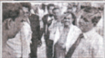
বাংলাদেশের সড়ক দুর্ঘটনাদের জন্য নিষিদ্ধ বাধ্যগলো যুগে দেখাছেন খুলনার কমিশনার

বাংলাদেশের সড়ক দুর্ঘটনাদের জন্য নিষিদ্ধ বাধ্যগলো যুগে দেখাছেন খুলনার কমিশনার বাংলাদেশের সড়ক দুর্ঘটনাদের জন্য নিষিদ্ধ বাধ্যগলো যুগে দেখাছেন খুলনার কমিশনার