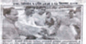
বাংলাদেশের সড়ক দুর্ঘটনাদের জন্য নিষিদ্ধ বাধ্যগলো যুগে দেখাছেন খুলনার কমিশনার

বাংলাদেশের সড়ক দুর্ঘটনাদের জন্য নিষিদ্ধ বাধ্যগলো যুগে দেখাছেন খুলনার কমিশনার বাংলাদেশের সড়ক দুর্ঘটনাদের জন্য নিষিদ্ধ বাধ্যগলো যুগে দেখাছেন খুলনার কমিশনার