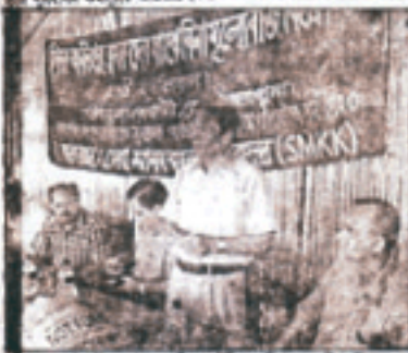
বেতাগীর কৃষকরা মহাখুশি

বেতাগীর কৃষকরা মহাখুশি বেতাগীর কৃষকরা মহাখুশি