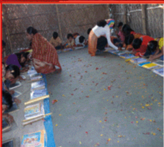
1) Rally on Child Right 2) Arsenic Program for Child 3) & 4) Rally on Fisheries 5) Education for Child