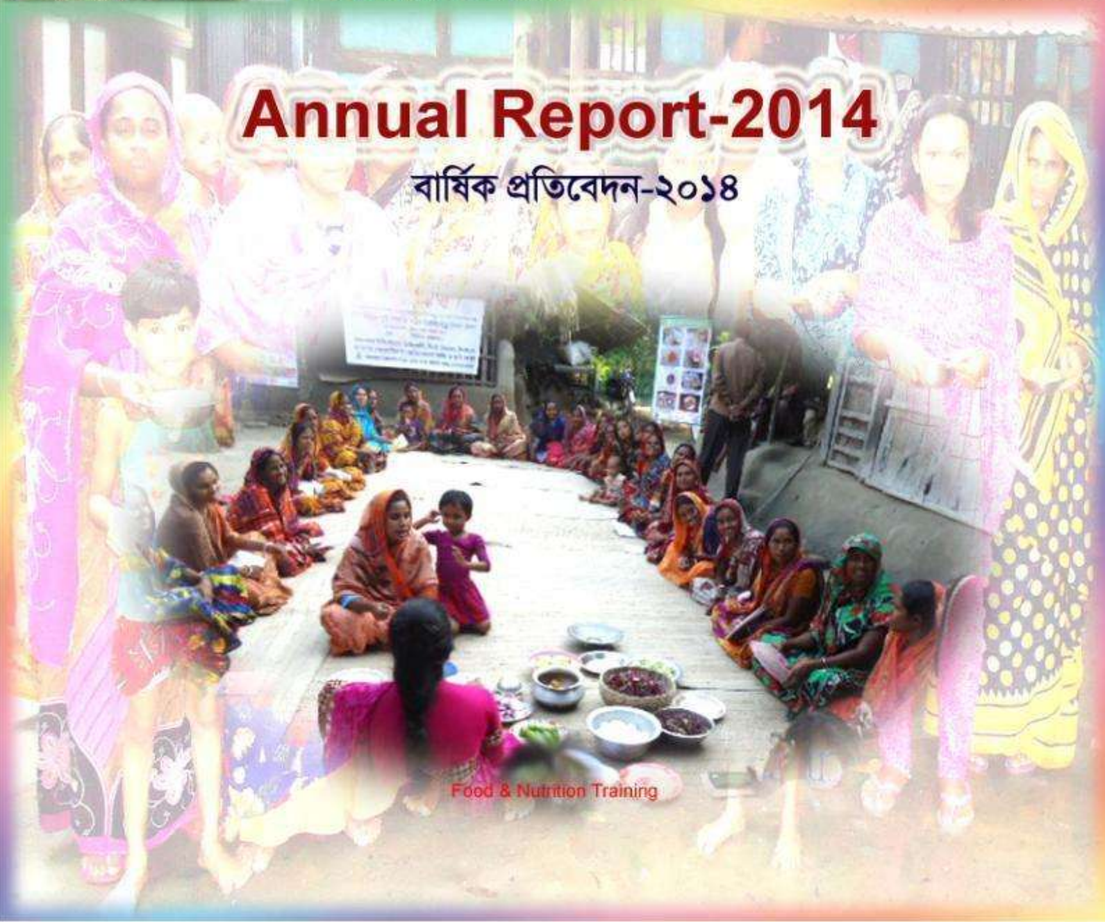
Food & Nutrition Training